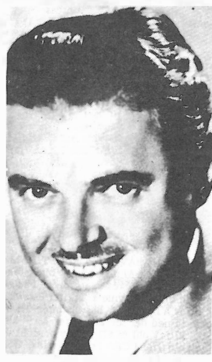
HANDSOME, talented Crawford was famed as "Poet of the Organ".