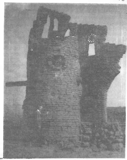
Advertise in the Alpine Sun.

George Lengbridge FOR TV: SERVICE Black & White or Color 445-3885